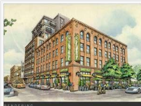
700 Central Ave Mixed Use Development

One block west of Central Avenue, the Northeast Development Corporation partnering with ArtSpace, is developing Jackson Flats, an artist live/work housing community project. Partially funded through low income housing grants, the Jackson Flats project will help revitalize a vacant parcel of land at the corner of 18 1/2 Avenue NE and Jackson Street NE.