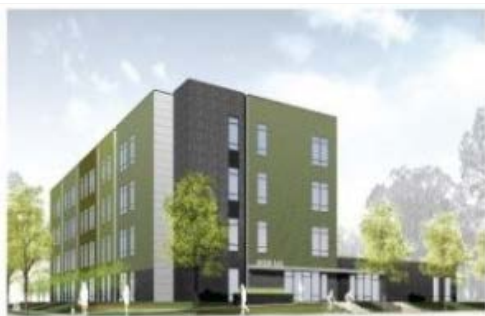
Jackson Flats Northeast Minneapolis, live-work art space

With many properties currently for sale along Central, it will be an interesting corridor to watch further develop. If you have a comment on community development cooperatives, Central Ave. development or other neighborhood development insights, please comment for further conversation!